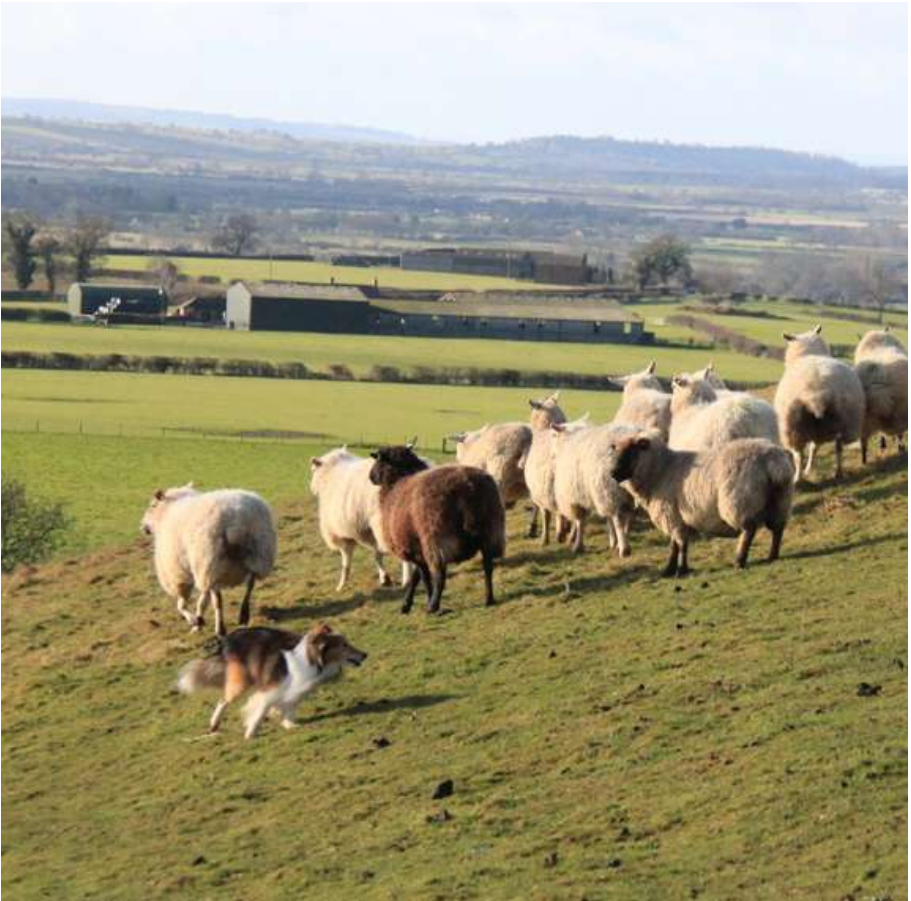
Lian Knight's Shelridge Saturn AW(G) herding sheep at Windy Ridge Farm in Warwickshire