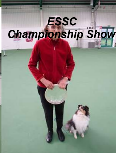
ESSC Championship Show